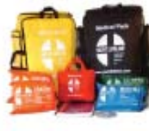
YACHT LIFELINE MEDICAL KITS