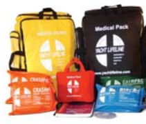
YACHT LIFELINE MEDICAL KITS